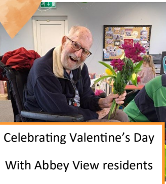
Celebrating Valentine's Day With Abbey View residents