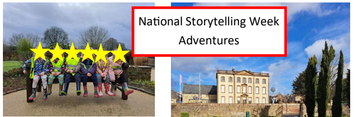
National Storytelling Week Adventures