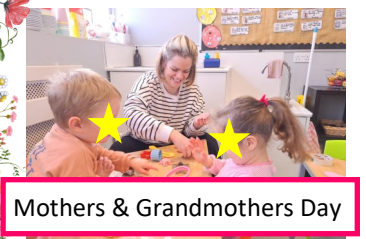
Mothers & Grandmothers Day