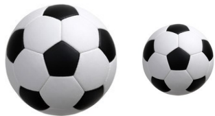
Pear Tree Little Kickers

Here are some highlights from the Spring Term!